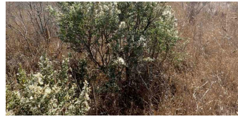
Female Coyote Bush in Bloom

on separate plants. More importantly however, blooming occurs late in the season, generally from August through December, with plants all over More Mesa either recently bloomed or currently in bloom.