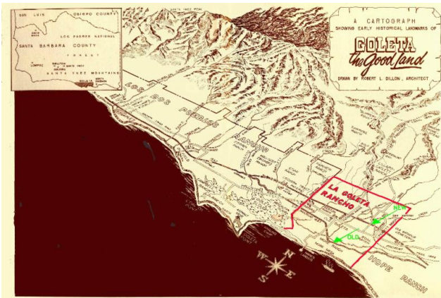
"Old" Southern Pacific Tracks Went Thru the More Ranch