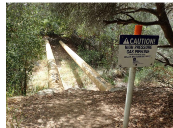
Pipes on North Side of More Mesa

However, a few decades later, our current gas supplier, Socal, hit upon an approach to make good use of the underground "storage space" that had housed the original natural gas. Recognizing that both demand and price for natural gas are low in summer, Socal pumps gas up from the south in summer and stores it underground on the west side of More Mesa and adjacent areas, in this existing natural gas aquifer. Come winter, when demand for heating is high, the gas is pumped out, thereby handily servicing gas company customers in the Goleta Valley and environs.