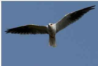
"Go See a Kite Fly"

It is the mission of the More Mesa Preservation Coalition, to preserve More Mesa, in its entirety, for all times. We've been at it since 2000.