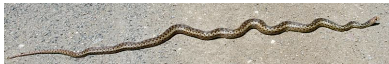
Gopher Snakes as long as 8 feet have been seen on More Mesa

This Month on More Mesa: In the past we have highlighted many of the biological treasures found on More Mesa; birds, plants, mammals and, in last month's update, our colorful insects, the butterflies. So it seems timely that the recent discovery of a very long Gopher Snake shed should prompt this month's discussion of the reptiles and amphibians of More Mesa.